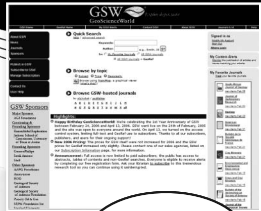
The GSW home page, showing a reader's favorite journals list

For information about subscribing, please visit: www.geoscienceworld.org/subscriptions/subscribe.dtl